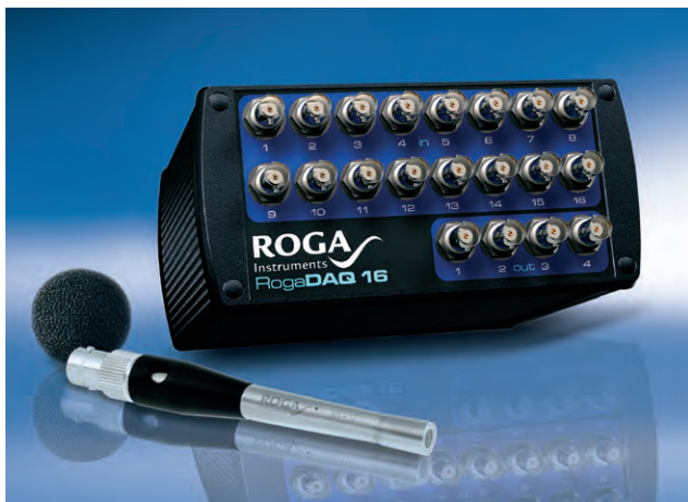
RogaDAQ16 in combination with MI-17 as a recommended hardware.